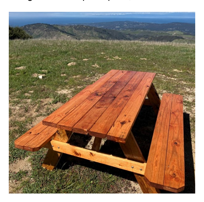
Palo Corona Backcountry Picnic Table

The picnic table located at Corona Peak in the Palo Corona Regional Park backcountry has been replaced. The previous table was destroyed by the wind event that impacted the region on February 4, 2024. This table will be utilized as an aid station for the upcoming Race for Open Space, which is scheduled for May 11.