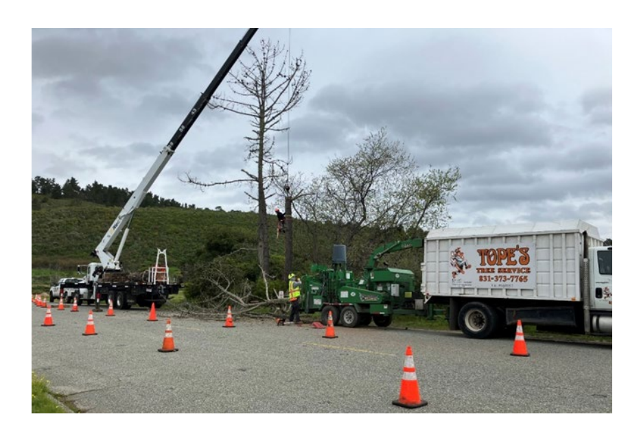
Tope's Tree Service Removing Dead Pine Trees on Village Park Drive