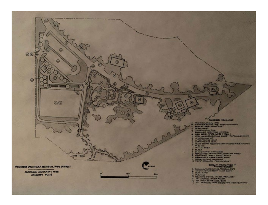
Cachagua Community Park – Initial Concept Plan