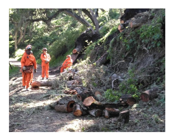
Trail Tread Maintenance