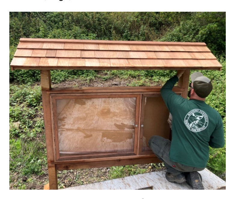
Ranger Installing Kiosk at PCRP Front Ranch

Rangers installed a new information kiosk at the junction of the Southbank Trail and the Palo Corona Front Ranch. The cost of this kiosk is reimbursable by FEMA because the previous kiosk was crushed by a large cottonwood tree during a winter storm last year. During the interim, staff relied on temporary signage to convey park rules, regs, and information.