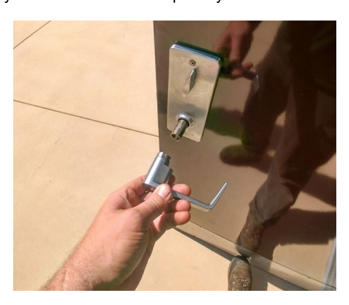
Broken handle on PCRP restroom building

Rangers are collaborating with a contractor to repair and replace a door latch on the Rancho Canada Unit restroom building where an interior handle has fallen off and required a family cabin to be closed temporarily.