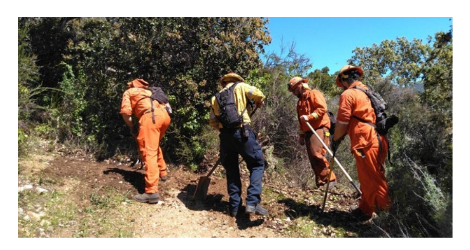
Gabilan Crew Working on Garza's Canyon Trail

A Gabilan Conservation Camp crew spent a couple of days at Garland Park clearing drain dips, high-limbing, and improving the trail tread along Garza's Canyon Trail. This time of year, moisture conditions are ideal for projects that involve movement of soil. Rangers will continue to prioritize projects that require soil relocation and compaction until moisture conditions diminish.