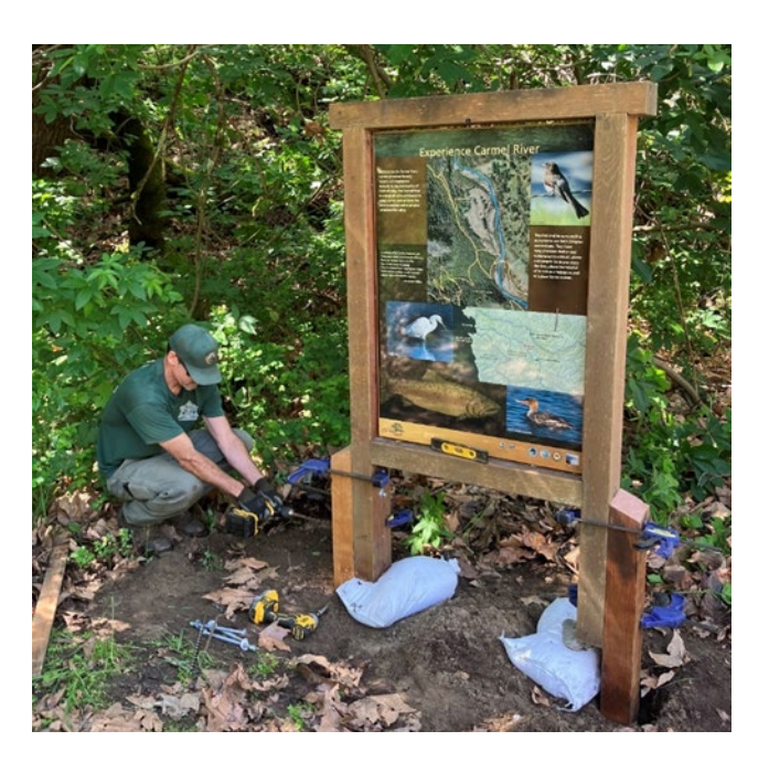
Rangers Reinstalling Interpretive Panel

Rangers repaired one of the Moo Property interpretive panels after the legs had deteriorated, broken, and caused the sign to topple. Fortunately, the panel was not damaged, and was reinstalled in the same location. This sign was funded by the Big Sur Land Trust during the acquisition of the Moo Property years ago and has proven to be extremely resilient. There are 4 of these interpretive panels throughout the Moo Property/River Trail corridor.