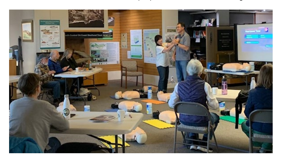
American Heart Association First Aid/CPR/AED Training

MPRPD personnel and Volunteers have participated or shall participate in First-Aid Training. Sessions have included Wilderness First Aid and CPR and AED use. The latter was led by the American Heart Association. The goal is to have all staff and Volunteers trained so that we are prepared to render life-saving measures.