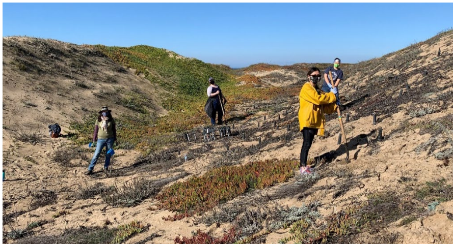
CSUMB's Return of the Native Staff and Service Learners restore areas of the Marina Dunes Preserve foredunes on January 23, 2021