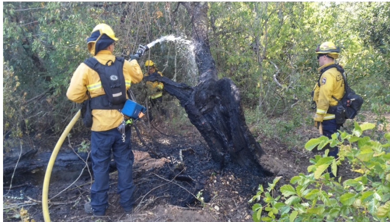
Firefighters dousing small wildfire at Garland Ranch

Four-days later, Rangers were able to identify and contact the “person of interest” reported to be in the area at the time the fire was reported. That person subsequently admitted to starting the fire. This information and evidence have been forwarded to Cal Fire for further action including, and up to, prosecution.