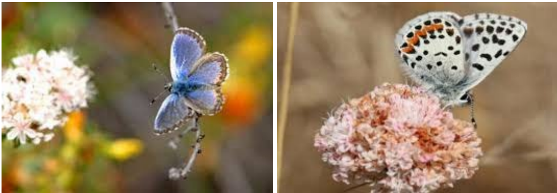
Euphilotes enoptes smithi (Smith’s Blue Butterfly)

The Burleson Team also installed “herbicide spray notification” signage in both English and Spanish in preparation for implementation of the Preserve’s weed eradication program.