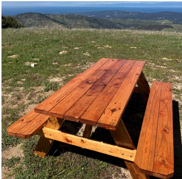
Palo Corona Backcountry Picnic Table

The picnic table located at Corona Peak in the Palo Corona Regional Park backcountry has been replaced. The previous table was destroyed by the wind event that impacted the region on February 4, 2024. This table will be utilized as an aid station for the upcoming Race for Open Space, which is scheduled for May 11.