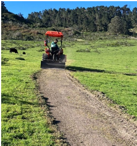
Trail Tread Maintenance

Rangers took advantage of ideal soil conditions to blade and roll the trails throughout Palo Corona Regional Park's Front Ranch Unit. This time of year, impacts from cattle grazing and rainfall require trail tread surface maintenance, which staff are able to accomplish in-house utilizing District equipment. Staff also worked with a Gabilan Inmate Crew to remove a cluster of oak trees that had fallen across the road leading to Inspiration Point and Animas Pond.