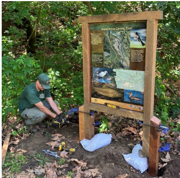
Rangers Reinstalling Interpretive Panel

Rangers repaired one of the Moo Property interpretive panels after the legs had deteriorated, broken, and caused the sign to topple. Fortunately, the panel was not damaged, and was reinstalled in the same location. This sign was funded by the Big Sur Land Trust during the acquisition of the Moo Property years ago and has proven to be extremely resilient. There are 4 of these interpretive panels throughout the Moo Property/River Trail corridor.