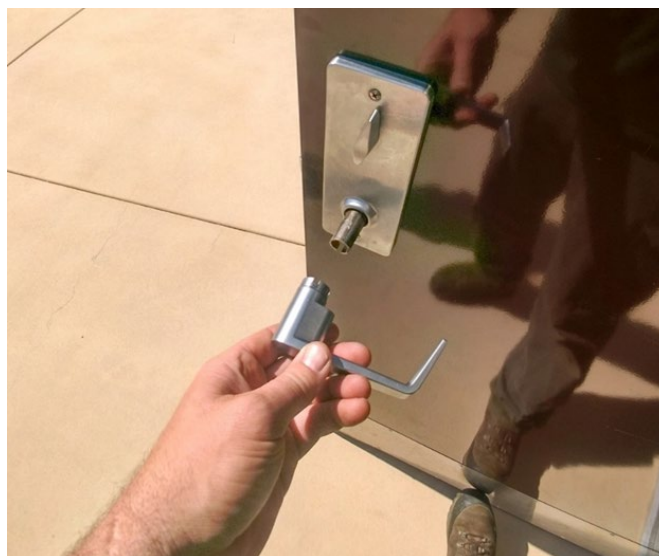
Broken handle on PCRP restroom building

Rangers are collaborating with a contractor to repair and replace a door latch on the Rancho Canada Unit restroom building where an interior handle has fallen off and required a family cabin to be closed temporarily.