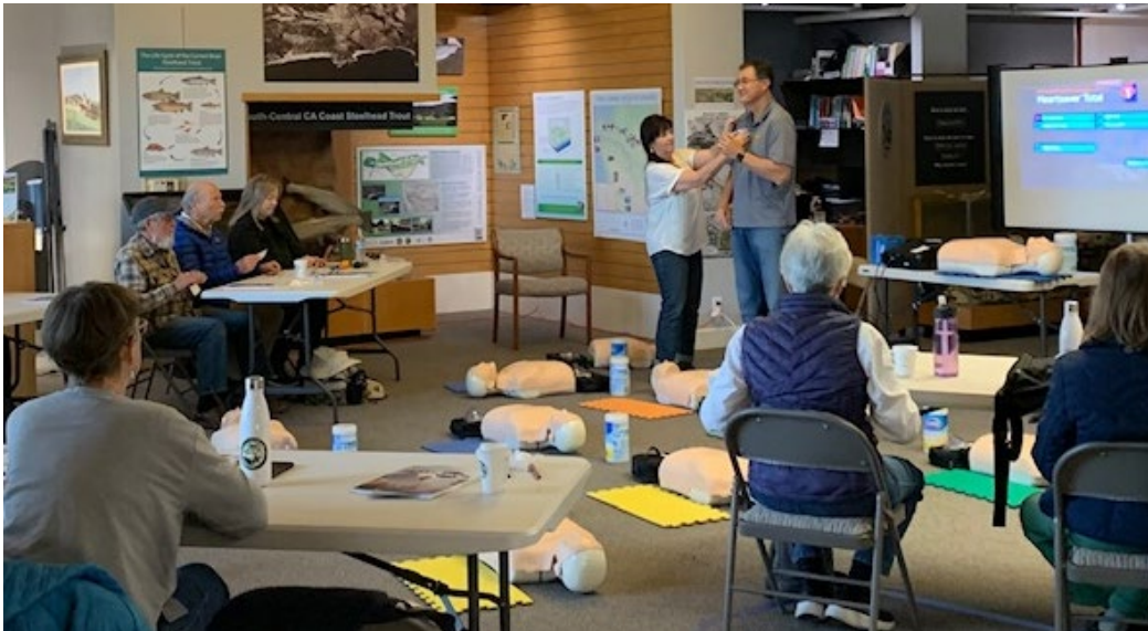
American Heart Association First Aid/CPR/AED Training

The latter was led by the American Heart Association. The goal is to have all staff and Volunteers trained so that we are prepared to render life-saving measures.