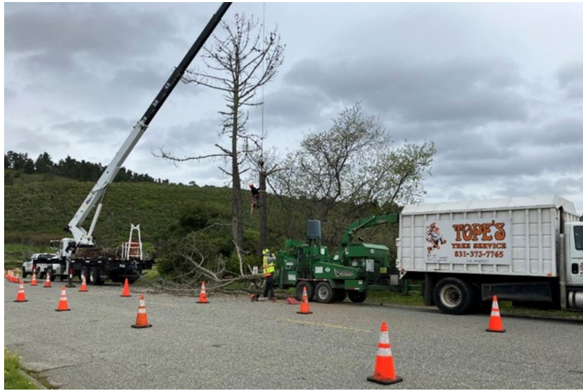
Topé's Tree Service Removing Dead Pine Trees on Village Park Drive