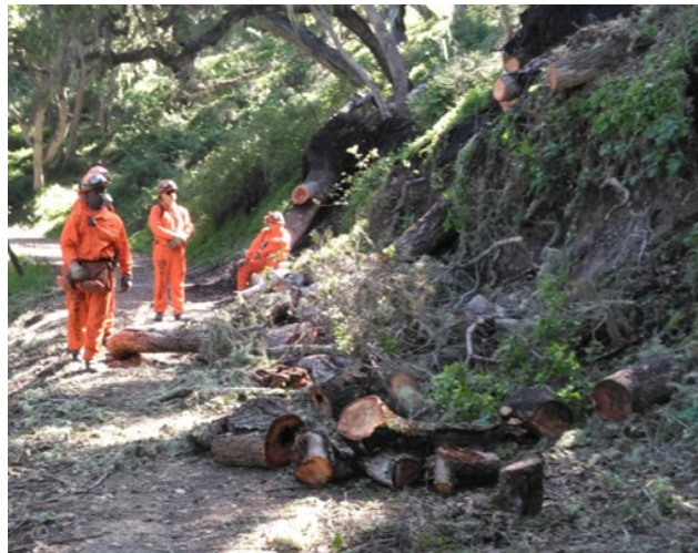
Gabilan Crew removing fallen Oak Trees