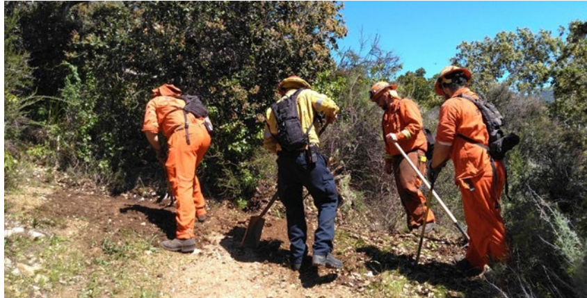
Gabilan Crew Working on Garza's Canyon Trail

A Gabilan Conservation Camp crew spent a couple of days at Garland Park clearing drain dips, high-limbing, and improving the trail tread along Garza's Canyon Trail. This time of year, moisture conditions are ideal for projects that involve movement of soil. Rangers will continue to prioritize projects that require soil relocation and compaction until moisture conditions diminish.