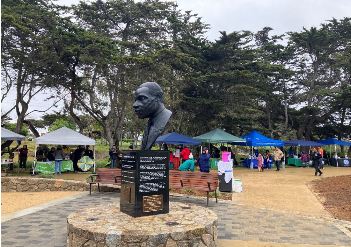
Images from Marina Earth Day at Locke-Paddon Wetland Community Park