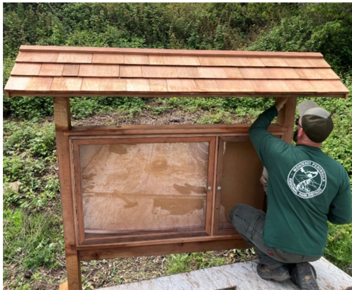
Ranger Installing Kiosk at PCRFP Front Ranch

Rangers installed a new information kiosk at the junction of the Southbank Trail and the Palo Corona Front Ranch. The cost of this kiosk is reimbursable by FEMA because the previous kiosk was crushed by a large cottonwood tree during a winter storm last year. During the interim, staff relied on temporary signage to convey park rules, regs, and information.