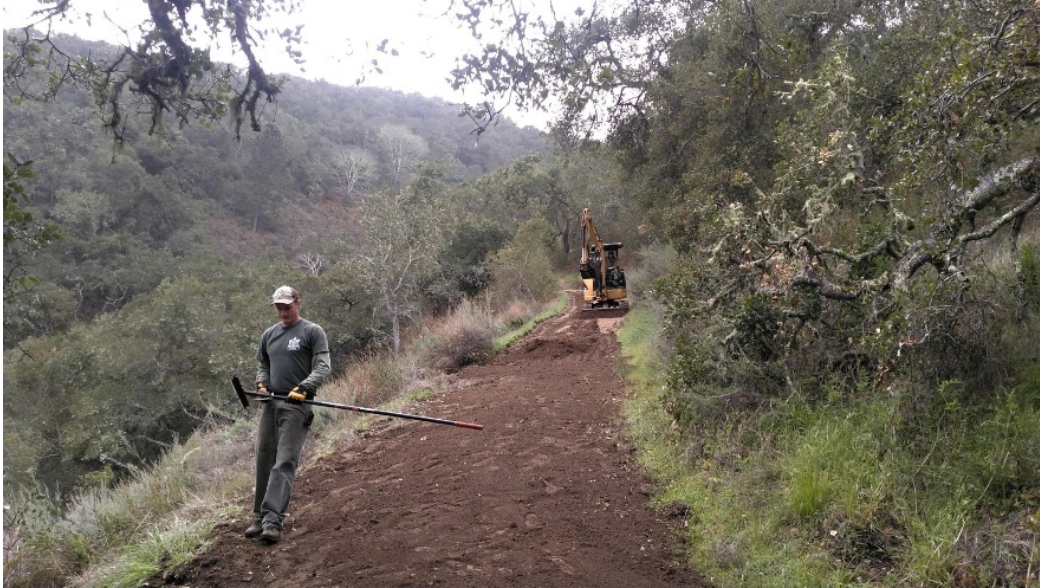
Rangers making trail improvements on existing trails