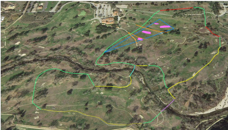
Proposed Cross-country Course/Fitness Trail at the Rancho Canada Unit